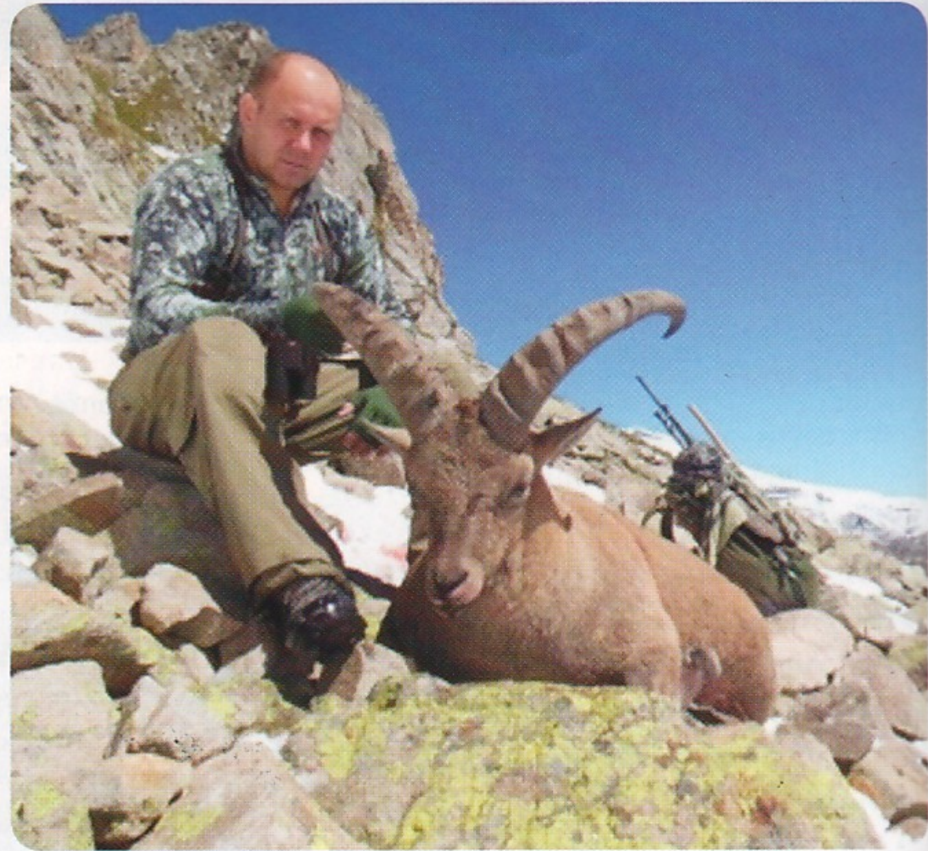
This mid-Caucasian tur from Russia was taken by Eduard Benderskiy (Russia) in 2013.

1. New Zealand tahr (2008) 2. Alpine chamois (2008) 3. Mid-Asian ibex (2009) 4. Balkan chamois (2010) 5. Caucasian chamois (2010) 6. Altay ibex (2010) 7. Kuban (Western) tur (2010) 8. Dagestan (Eastern) tur (2010) 9. Bezoar ibex (2011) 10. Gredos ibex (2011) 11. Beceite ibex (2012) 12. Southeastern ibex (2012) 13. Ronda ibex (2012) 14. Pyrenean chamois (2013) 15. Cantabrian chamois (2013) 16. Carpathian chamois (2013) 17. Low Tatra chamois (2013) 18. Kri-Kri ibex (2013) 19. Alpine ibex (2013) 20. Persian desert ibex (2013) 21. Mid-Caucasian tur (2013) 22. Mallorcan wild goat (2013) 23. Feral goat (2013)